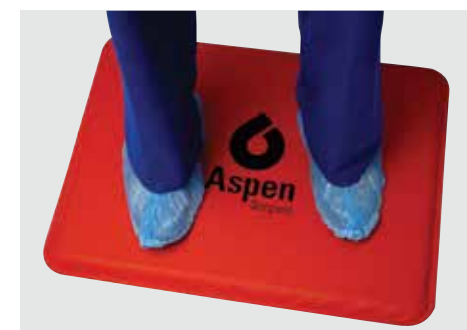
ErgoSupport® Anti-Fatigue Mat