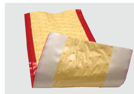
SurgiSafe® O.R. Cord Cover